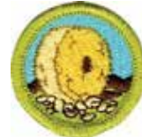
Inventing Merit Badge