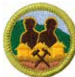
Mining in Society Merit Badge