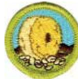
Inventing Merit Badge