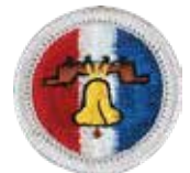
Citizenship in the Nation Merit Badge