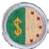
Personal Management Merit Badge